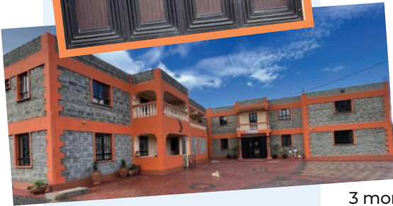
Sister2Sister International Outreach Ministry, Inc. is a 501(c)3 non-profit organization.